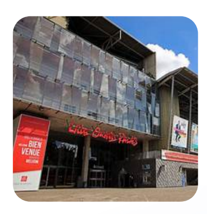
Lille Grand Palais Lille, France

Watch the Ernst Plenary on Environmentally Sustainable MRI Equipment in real time, and celebrate at our special social event in Lille. Don't miss this unique blend of virtual and in-person learning!